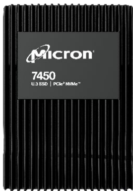
U.3: 7mm and 15mm

Designed as a mainstream solution, the 7450 SSD balances performance and density. Our offering includes a PCIe Gen4, M.2, 22 x 80mm with power-loss protection 4 and a 7.68TB E1.S that delivers industry-leading capacity. 5